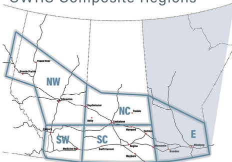
FIGURE 1 2022 Western Canadian CWRS Composite Regions