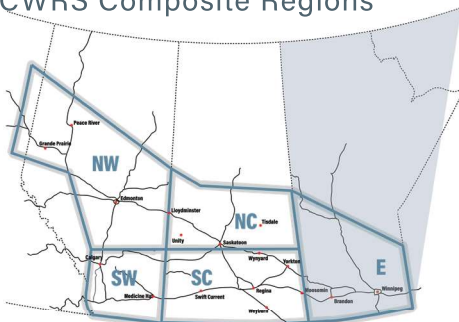
FIGURE 1 2022 Western Canadian CWRS Composite Regions